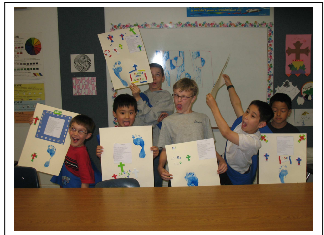
The Blue Knights with their silly pose.